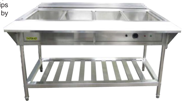
EST-240 shown with optional cutting board and tray holder