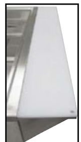
EST-240/PCB 9" Cutting Board

Warranty: This product is protected by Admiral Craft Equipment Corporation's one year limited warranty. Should your product fail under normal use it will be repaired or replaced up to one year from date of purchase.